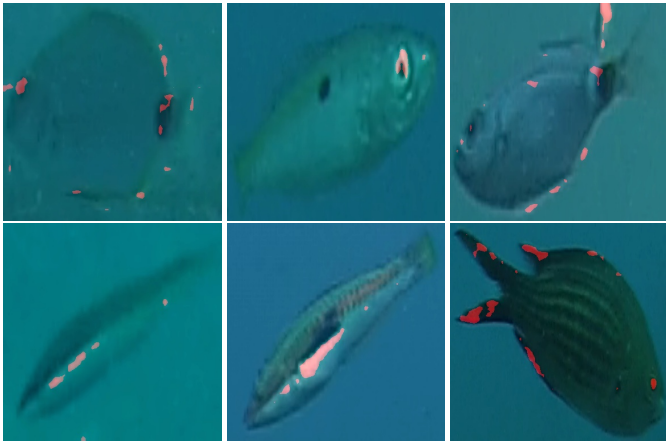
Figure 3: Samples of the output heatmaps obtained with PIM.

Although multiple CNNs can be used as backbone with PIM, we chose the Swin Transformer [3]. The results obtained can be reproduced using the seed 42. We trained for 20 epochs with Stochastic Gradient Descent as the optimization algorithm, automatic mixed precision, the raw data resized to 384 \times 384 pixels, with a batch size of 16.