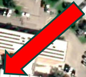
Airbus Pleiades Neo (7 September '22)